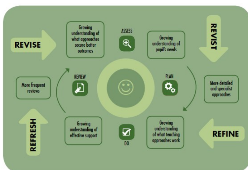
Fig 2. NASEND SEND Support and the Graduated Approach, 2014

Wave 2 Targeted SEND Support – Key teachers may need to identify more targeted SEND Support for a student. This takes the form of a four-part graduated approach to understanding and supporting a student’s needs - Assess, Plan, Do, Review. This includes assessing the student’s needs, planning the appropriate intervention, providing the intervention and reviewing the impact of the intervention on the student’s learning (see diagram below). Targeted SEND Support can include 1:1 teaching, small group interventions and mentoring. It is the key teacher’s responsibility to liaise with the student’s home school (for any admission over 10 working days) and to be informed of any targeted SEND support a student is accessing in their home school. Where possible the teacher and the SENDCo will endeavour to ensure that the student can continue to access this intervention during their time at CCHS.